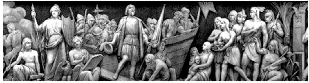
America in History